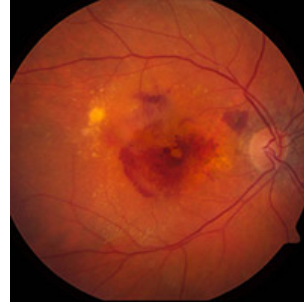
Damage from Macular Degeneration

I have read and understand the importance of this testing.