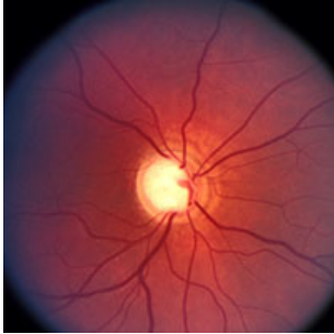
Damage from Glaucoma